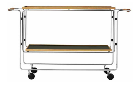
HB 128 Bar Cart Horst Brüning - 1968 Frame in chrome-plated steel, black tray with oak edges and handgrip in leather. H: 61 cm W: 45 cm L: 104 cm

HB 6917 Bar Stool Horst Brüning - 1968 Bar Stool in anilin leather. Frame in chrome-plated steel. H: 78 cm Ø: 46 cm