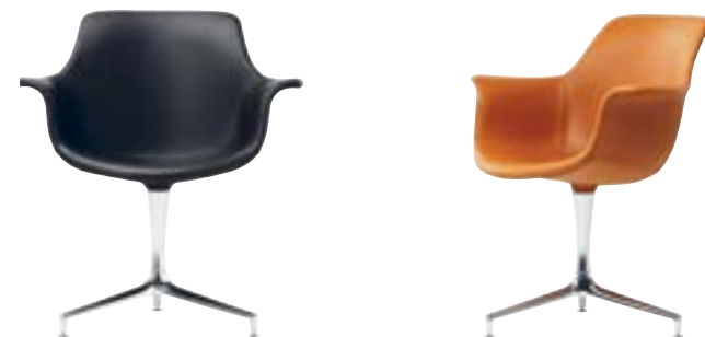
JK 810 Chair Jørgen Kastholm - 1968

Aluminum base with shell in Glass fiber enforced PP. 3 star aluminum base. H: 87 cm W: 77 cm D: 59 cm SH: 45 cm